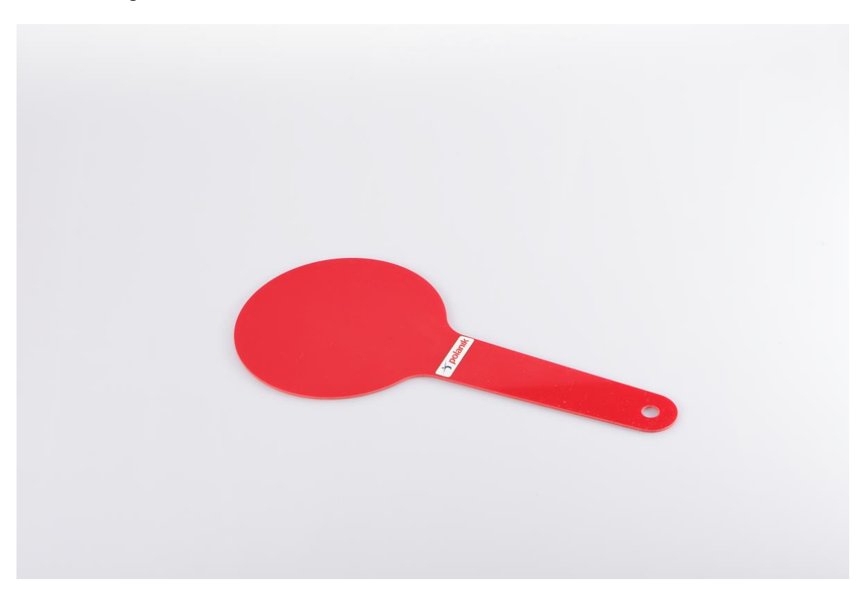
TSC-R © 2016 Polanik

The \ producer \ reserves \ the \ right \ to \ introduce \ without \ warning \ changes \ in \ product \ constructions \ and \ colours.