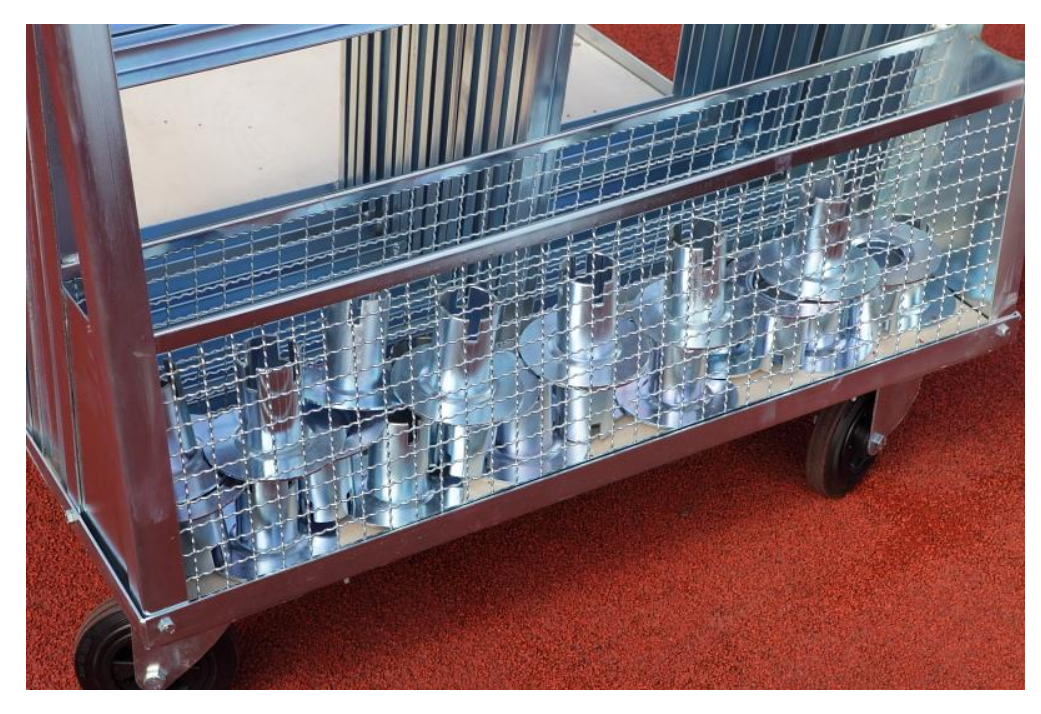
Wire netting container