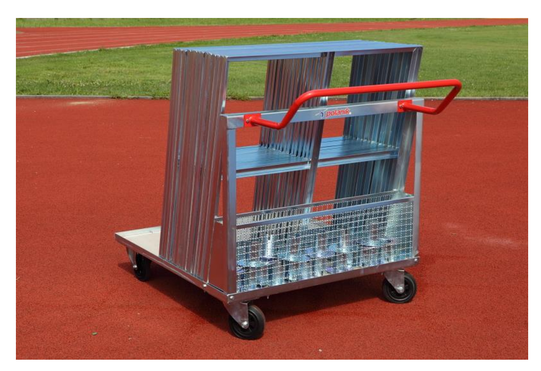
New ergonomic handle

Polanik SZG-30 cart is a durable galvanized steel construction. It is equipped with an universal platform (dimensions 100 cm x 92,5 cm) and wire netting container for small elements.. It is also equipped with an ergonomic handle and thanks to this it's easy to move. The cart is designed for transporting modular grid platforms which whole weight is up to 400 kg.