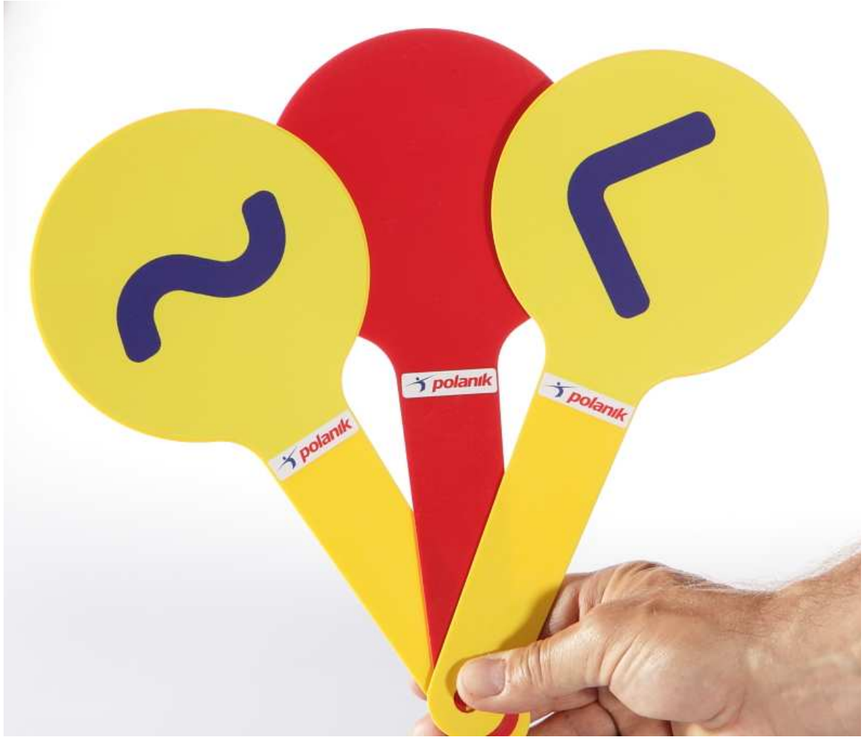
TSC-3 © 2014 Polanik

The producer reserves the right to introduce without warning changes in product constructions and colours.