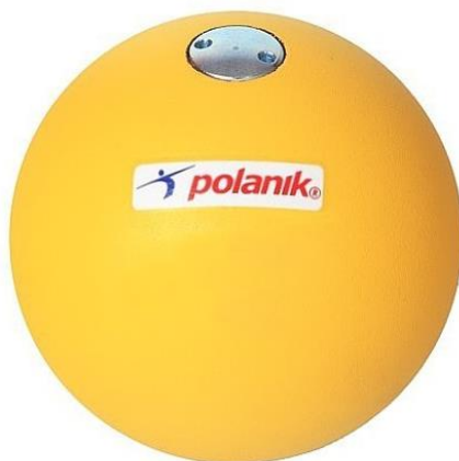
Competition steel painted shot put