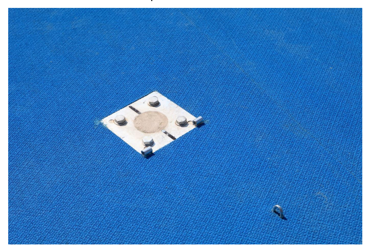
Anchor in concrete