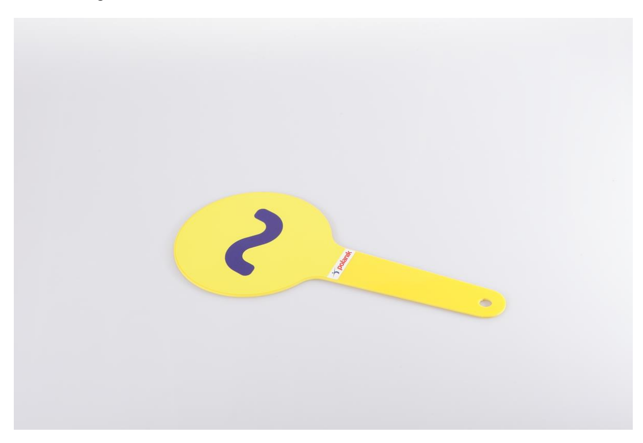
TSC-LC © 2016 Polanik

The producer reserves the right to introduce without warning changes in product constructions and colours.